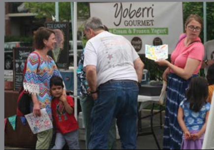
$25,000 spent sponsoring community events