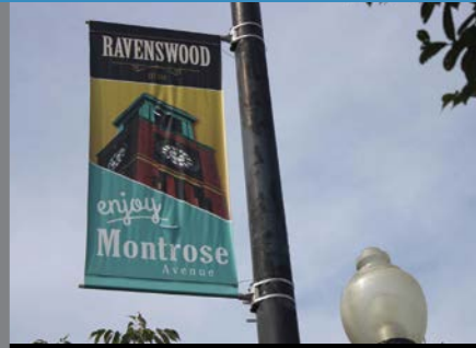
52 street-pole banners installed