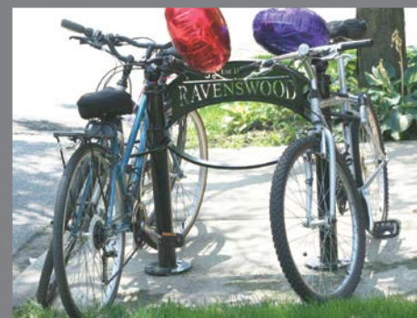
25 bike racks installed