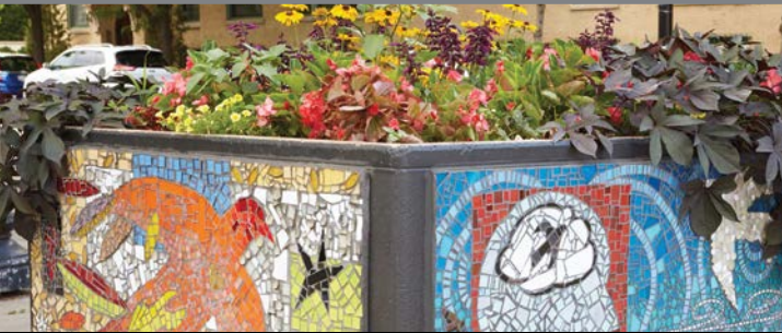
26 planters landscaped