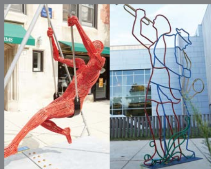
2 sculptures installed