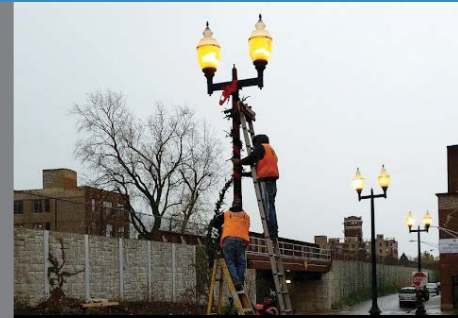
380 street poles decorated for the holidays