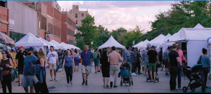
15,600 attendees at SSA-sponsored events