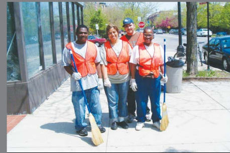
4,212 trash cans emptied