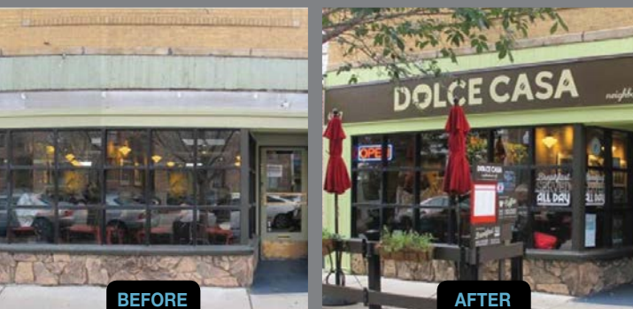
$9,650 spent rehabbing 4 storefronts